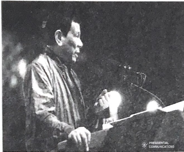
President Rodrigo Duterte delivers his speech during the Partido Demokratiko Pilipino-Lakas ng Bayan (PDP-Laban) campaign rally at the Bacolod City Government Center Football Field in Negros Occidental on April 11, 2019.

President Rodrigo Duterte said the national budget was just recently submitted. He would not hesitate to veto the 2019 national budget if he finds irregularities in it.